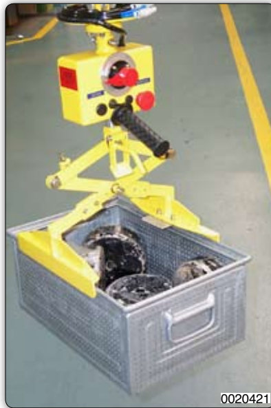
Manipulator with pantograph tooling for handling containers.