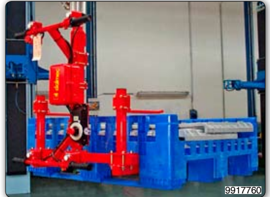
Manipulator with fork type tooling for handling plastic cases.