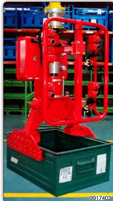
Manipulator with pneumatic tooling for gripping containers. 机械手臂, 装备气动工具, 用于抓取容器