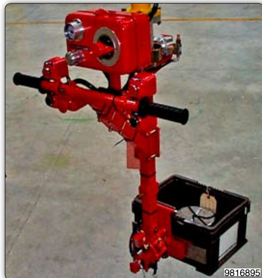
Manipulator with fork type tooling for gripping and handling containers. 机械手臂, 配备叉, 用于抓取和搬运容器