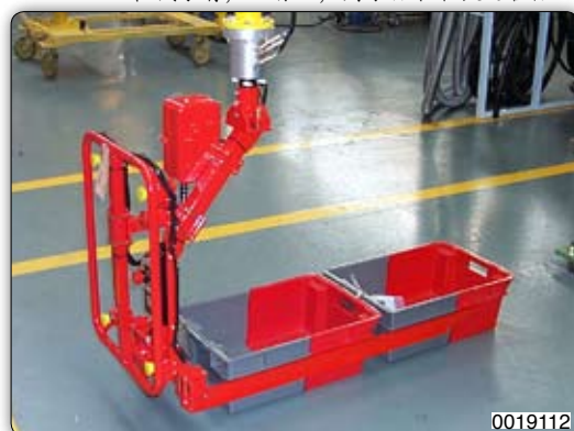
Manipulator with fork type tooling for gripping and handling containers. 机械手臂, 配备叉, 用于抓取和搬运容器