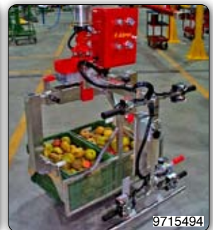
Gripping devices for handling containers of food products. In particular: 用于抓取食品容器的抓取工具。如下: - jaws tooling suitable for gripping and emptying carton boxes, containing tobacco, having different dimensions -卡爪, 适用于抓取和倒空装有烟草的不同大小的纸箱。 - a simple tooling for plastic boxes with manual rotation 可以手动翻转的用于抓取塑料盒子的简单工具。 - hooks tooling made of stainless steel for handling plastic boxes 由不锈钢制成用于抓取塑料盒子的挂钩。 - jaws stainless steel tooling for handling plastics boxes containing apples. 由不锈钢制成的卡爪, 用于抓取装有苹果的塑料盒子。