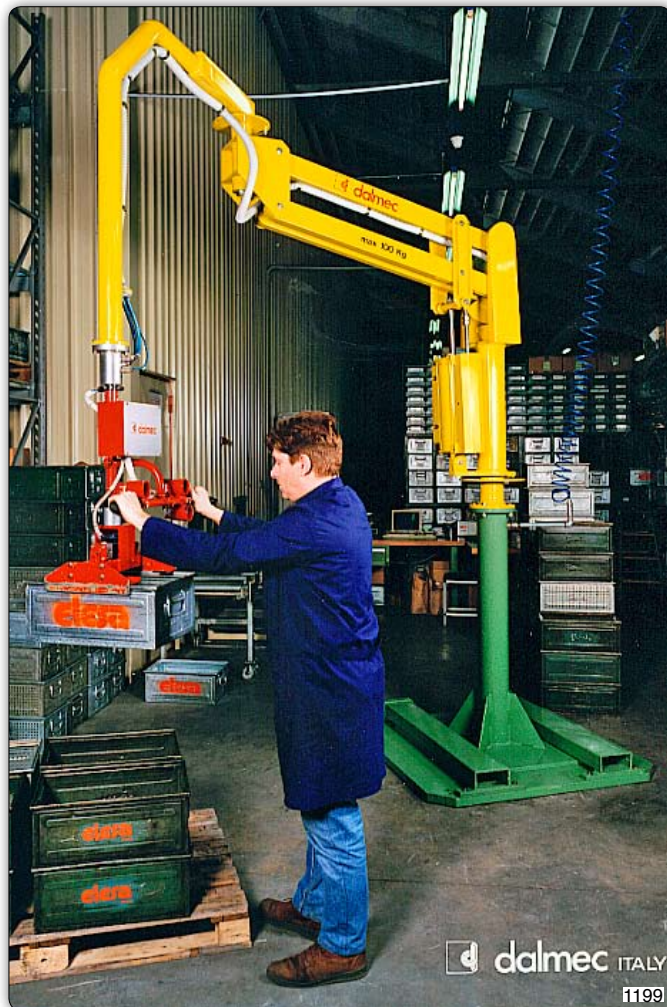
PMC type Partner manipulator, column mounted on forkable base-plate, with jaws tooling for handling containers. 机械手臂 Partner PMC, 支柱式, 配备可用叉车移动的基座, 配备弓形工具, 用于搬运容器