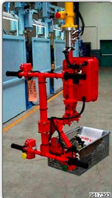
Manipulator with fork type tooling for handling metallic containers. 机械手臂, 配备叉, 用于搬运金属容器