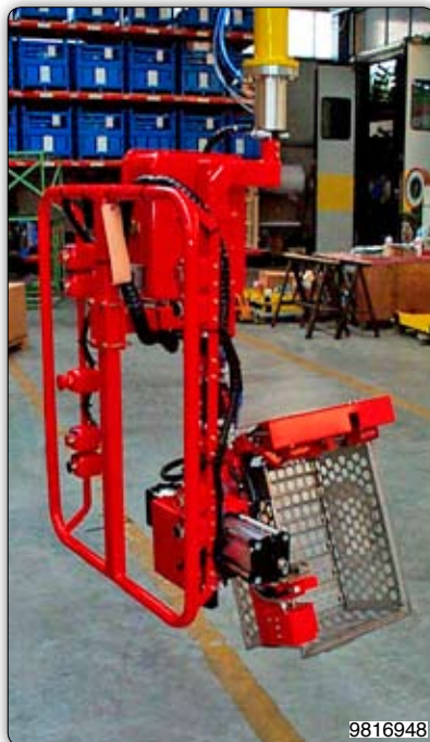
Manipulator with pneumatic tooling for gripping and turn containers. 机械手臂, 装备气动工具, 用于抓取和翻转容器