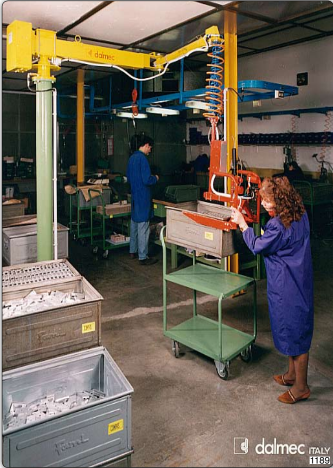
Posifil PFC column mounted Manipulator with forks tooling for handling crates.