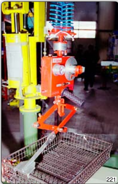
Manipulator with pantograph tooling for handling metallic baskets.