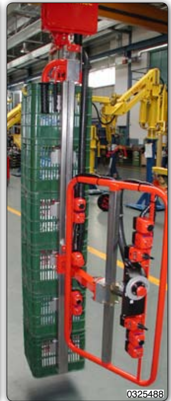
Partner Manipulator overhead trolley mounted version with pneumatic motorization, equipped with multiple adjustable hooks gripping system for handling 1 to 8 beverage crates having different dimensions. Manipulator Partner, 高架行车式, 装备气动马达, 多个型号挂钩, 可以搬运1到8个尺寸不同的饮料包装箱。