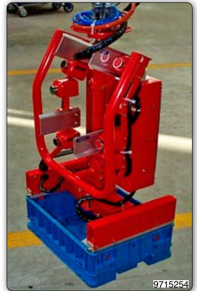
Manipulator with jaws tooling for gripping on the upper edge of the containers.