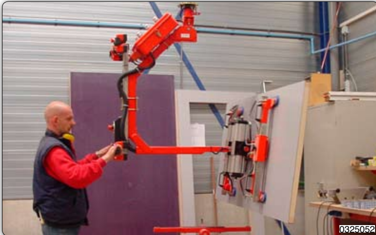
Suction tooling for handling and 180° pneumatic rotation of wooden panels with different dimensions. The position of the suction cups is manually adjustable. 吸盘, 可用于搬运和180度气动旋转不同尺寸木材壁板。吸盘的位置可调整。