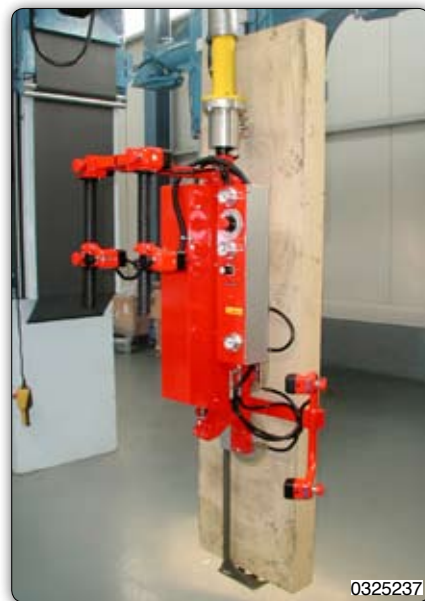
Suction tooling with centerings for handling and inclination of special panels. 定心吸盘, 可搬运和倾斜特殊壁板。