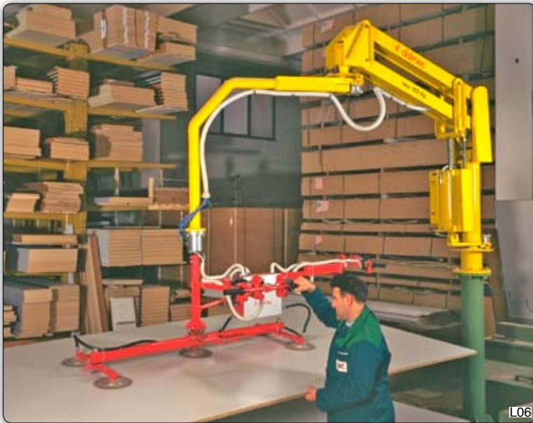
PMC type Partner manipulator, column mounted, fitted with suction head for picking a panel from a pallet and then for placing it onto a framing machine following shaving. Manipulator partner PMC, 支柱式, 装备吸盘, 可将壁板从货架抓取放在成型机器上。