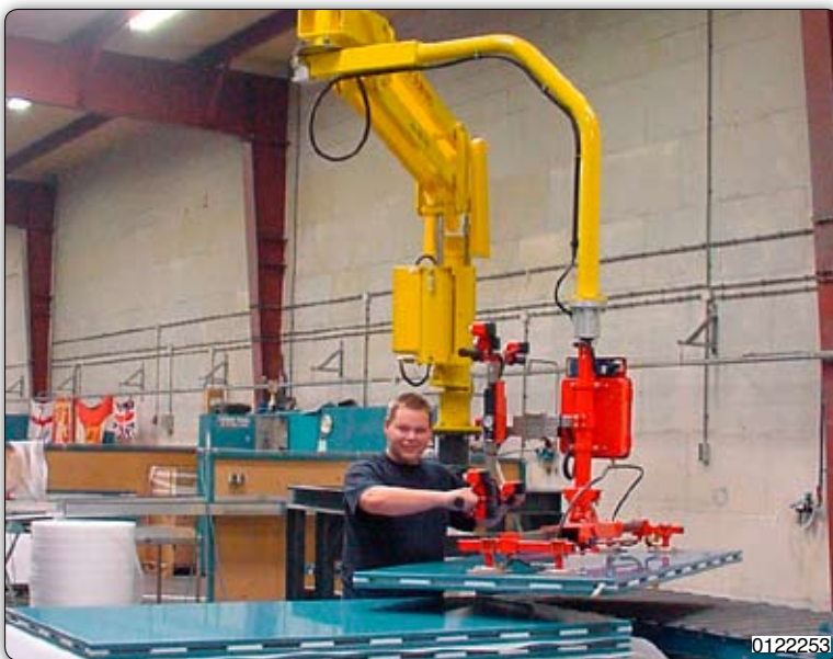
PMC type Partner manipulator, column mounted, fitted with adjustable suction cups tooling for handling panels. Manipulator Partner PMC, 支柱式, 配备可调整吸盘, 用于搬运壁板。