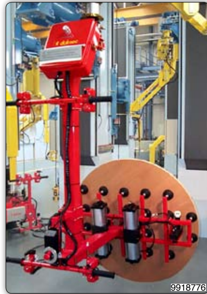
Suction cups tooling for handling and 180° pneumatic rotation of wooden panels. 吸盘, 可用于搬运和180度气动旋转木材壁板。