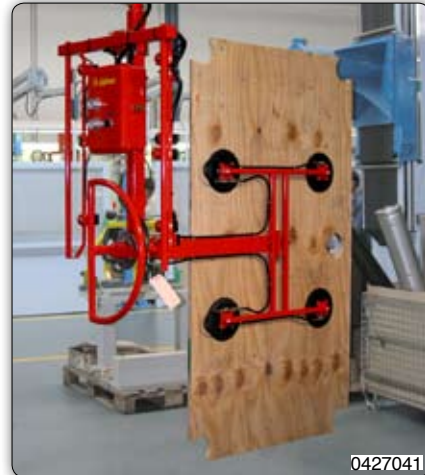
Suction cups tooling for handling wooden panels with manual rotation. 吸盘, 可用于搬运和手动旋转木材壁板。