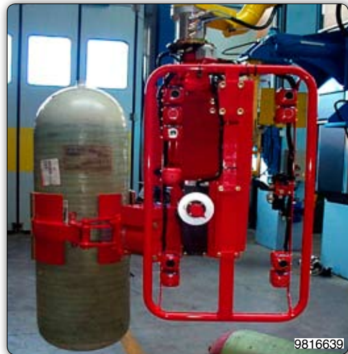
Manipulator with pneumatic gripping tool for picking and 90° pneumatic inclination of cylinders. Manipulator 配备气动抓手, 抓取和90度气动倾斜气瓶。