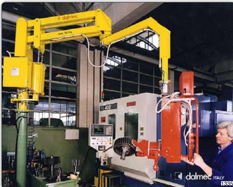
PMC type Partner manipulator, column design, with special equipment for picking, inclination and rotation of gears. Manipulator Partner PMC, 支柱式, 配备特殊设备以便抓取, 倾斜和旋转齿轮。

Manipulator Partner PMC, 支柱式, 用于在涂层厂装卸组装钢板弹簧。此机械手臂装备两套可以快速互换的抓手: 一个是用电子控制的永久磁铁, 另一个用爪子。