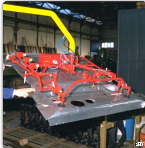
Suction tooling head used to handle motor vehicle floor pans from pallets to welding machine. 吸附工具用于将汽车地板盘从货架上搬运到焊机旁。