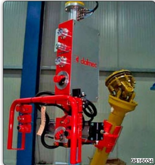
Manipulator with pneumatic gripper for taking and rotating transmission shafts. Manipulator 装备气动抓手, 用于搬运传动轴。