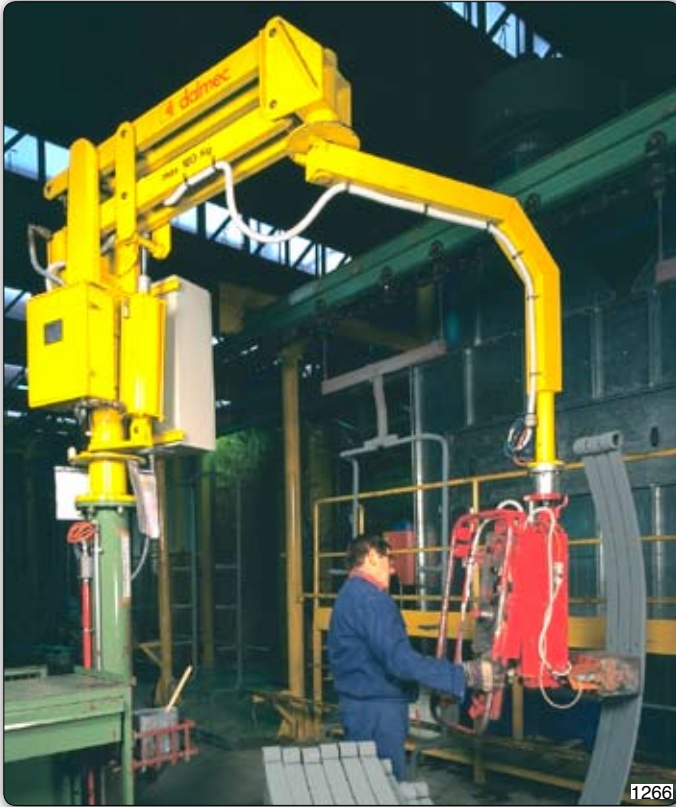
PMC type Partner manipulator, special column design, with integrated permanent electromagnets designed for taking two or three leaf springs at the same time which are placed level nearby on a pallet and, with the control of inclination up to 90°, for positioning them vertically on the balancing unit of a coating line. Manipulator Partner PMC, 支柱式, 装备电磁铁, 可一次搬运2到3个钢板弹簧, 并将之放在同水平的货架上。可翻转90度, 并纵向安放。