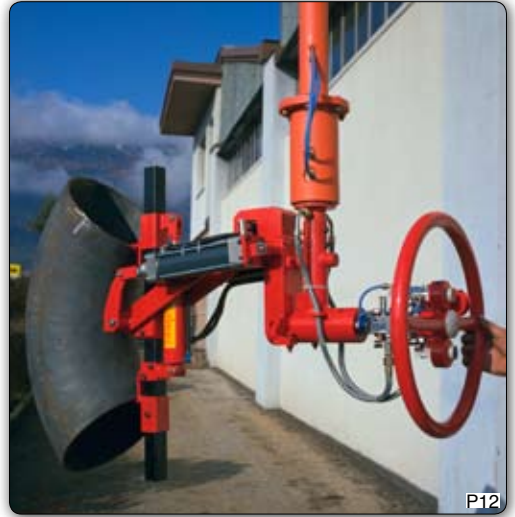
Pneumatically actuated jaws for gripping metal curved tubing, complete with pneumatic 90° inclination system and manual rotation through 180°. 气动钳口, 用于抓取金属管道, 并可将其气动倾斜90度并手动旋转180度。