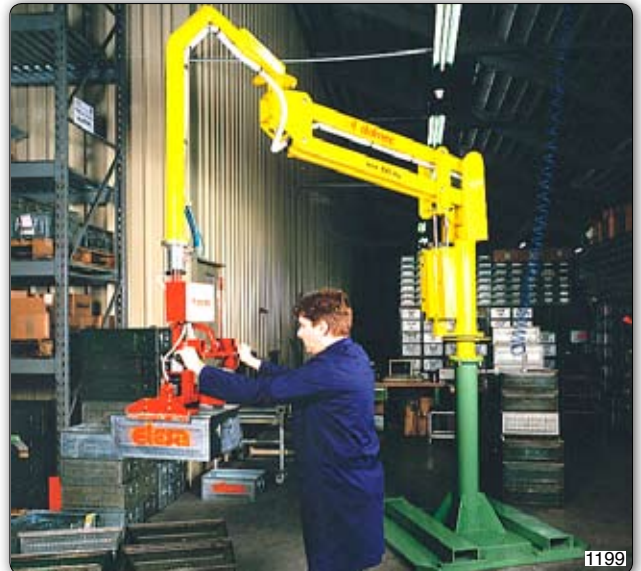
PMC type Partner manipulator, low profile column unit for operating in an area with low ceiling height. The unit is equipped with pneumatic grippers for handling electrical collectors, and enables the operator to handle them in a off-set position. Manipulator Partner PMC, 紧凑型支柱式, 为低房顶厂房而设计。配备气动卡爪, 搬运电气元件。