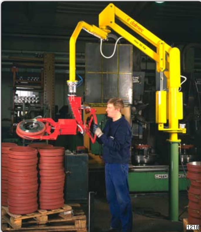
PMC type Partner manipulator, column mounted, with pneumatic tooling for picking mechanical components and manually rotating them through 180°, for use on a machining centre. Manipulator Partner PMC, 支柱式, 配备气动工具, 用于抓取机械元件, 并手动旋转180度, 并将之放在加工机器中心。