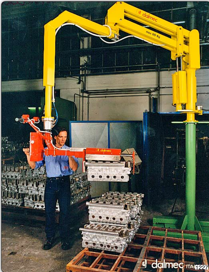
PMC type Partner manipulator, column mounted version, used for the handling of crankcase sets. Manipulator Partner PMC, 支柱式, 用于搬运变速箱。