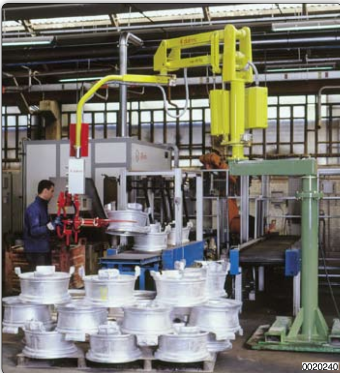
PMC type Partner, column mounted manipulator, with gripper equipment, made for taking and moving tractor rims of various sizes. Manipulator Partner PMC, 支柱式, 装备抓手, 用于搬运各种尺寸的拖拉机轮胎