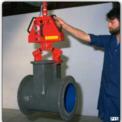
Pneumatic equipment to move valve bodies. The grippers are adjustable to allow picking of valves with different dimensions. 搬运阀的气动设备, 抓手可以调整, 以便调整抓取不同尺寸的阀。