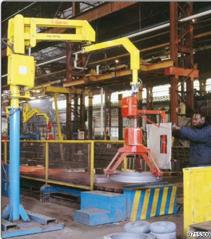
PMC type Partner manipulator, column design, with pneumatic gripper equipment, made to move mechanical parts from pallets to a vertical machine tool. Manipulator Partner PMC, 支柱式, 装备气动抓手, 用于将机械部件从货架上搬运到立式机床上。