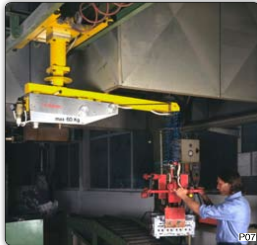
MPS type Minipartner manipulator, overhead trolley mounted running in dual track, with pneumatic tooling for the picking and placing crankcases from a roller conveyor on a pallet. Manipulator Minipartner MPS, 双轨道高架行车式, 配备气动工具, 用于从传送带上抓取曲轴箱, 并将之放在货架上。