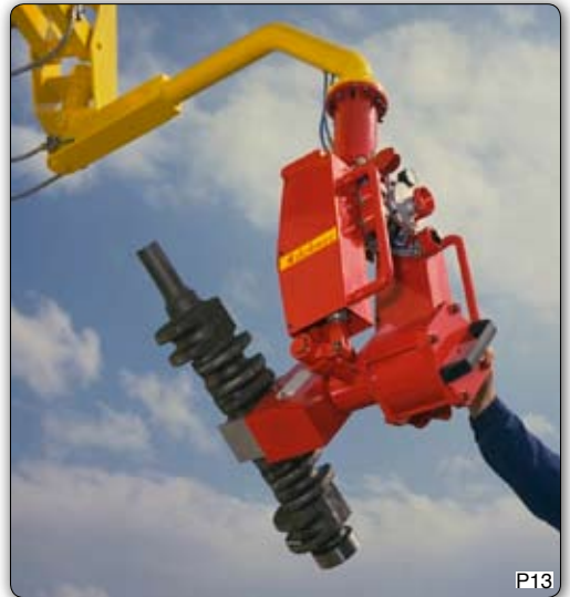
Pneumatic gripper made for positioning drive shafts on a work centre. 气动抓手, 用于在工作区域中心搬运驱动轴。