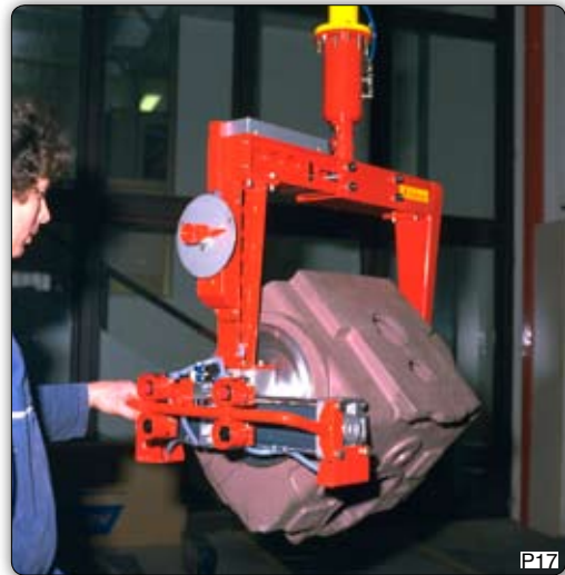
Manipulator with pneumatic equipment for taking by the two lateral holes and pneumatic rotation through 180° of reduction gear bodies, which is used for a boring machine. Manipulator 配备抓取侧面有两个孔部件的气动设备, 抓取镗床减速器并气动旋转180度