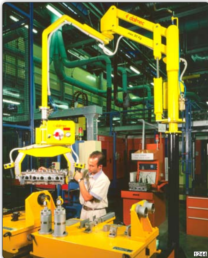
PMC type Partner manipulator, column mounted, used to handle cylinder heads. Manipulator Partner PMC, 支柱式, 用于搬运气缸头。