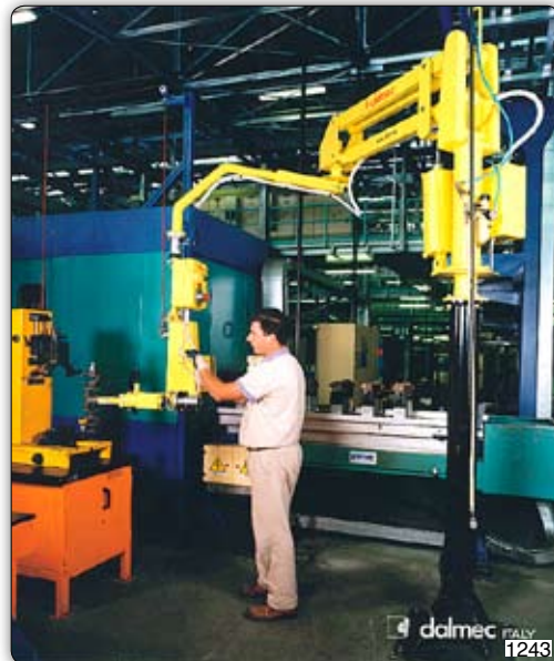
PMC type Partner manipulator, column mounted, equipped with pneumatic tooling for the picking and rotation of mechanical components. Manipulator Partner PMC, 支柱式, 配备气动工具, 用于抓取机械元件, 并旋转。