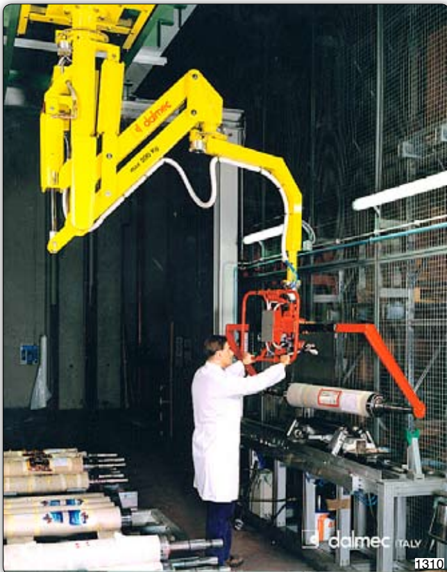
Pinch jaws tooling for the gripping and pneumatic rotation of milling machines parts having different forms and weights. 卡爪，用于抓取和气动旋转不同尺寸和重量的铣床元件。