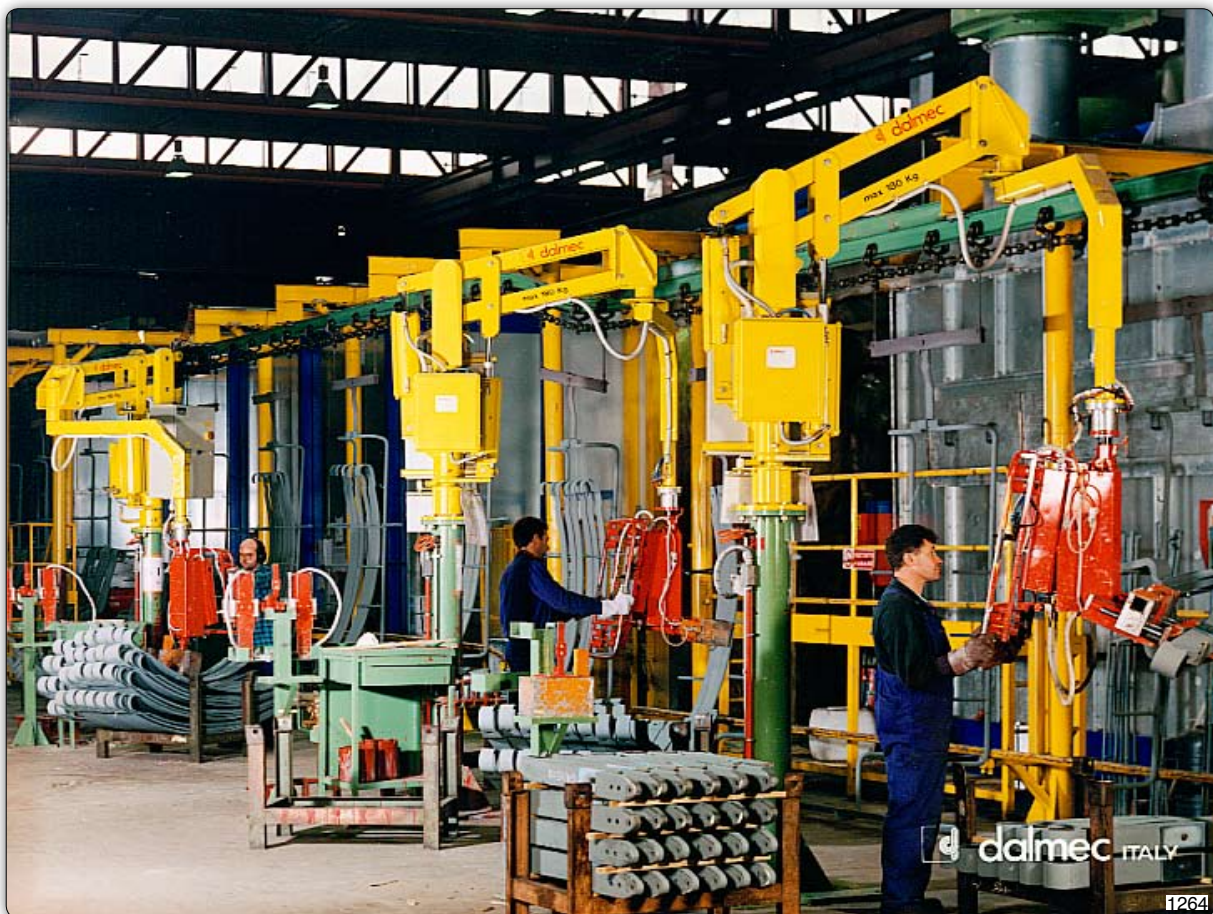
PMC type Partner manipulator, column design, equipped for loading and unloading of assembled leaf springs from a coating plant. The Manipulators have been given two types of picking equipment, which may be interchanged quickly: one uses a permanent magnet with electronic control and the other uses grippers.

Manipulator Partner PMC, 支柱式, 用于在涂层厂装卸组装钢板弹簧。此机械手臂装备两套可以快速互换的抓手: 一个是用电子控制的永久磁铁, 另一个用爪子。