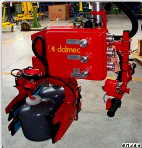
Manipulator with pneumatic tooling for gripping and inclination of cylinders having different dimensions. 装备气动工具的机械手臂，用于抓取和倾斜不同尺寸的气缸。