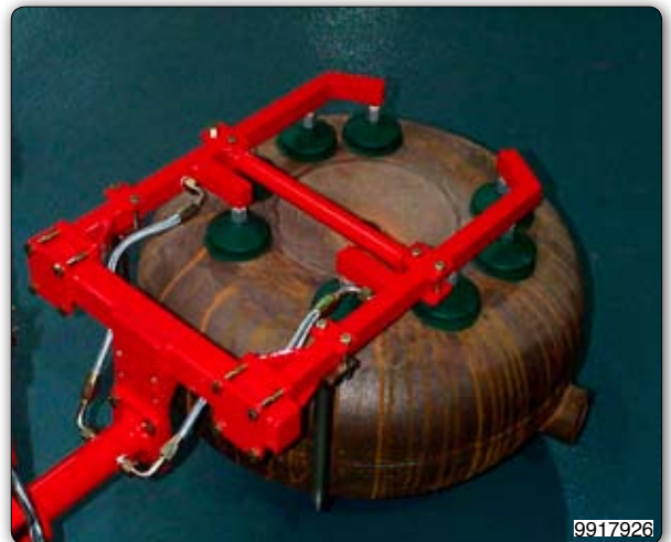
Manipulator with suction cup tooling (Venturi) for gripping and manual rotation of round tanks. 装备真空吸盘（文丘里）的机械手臂，用于抓取和手动翻转圆形油箱。