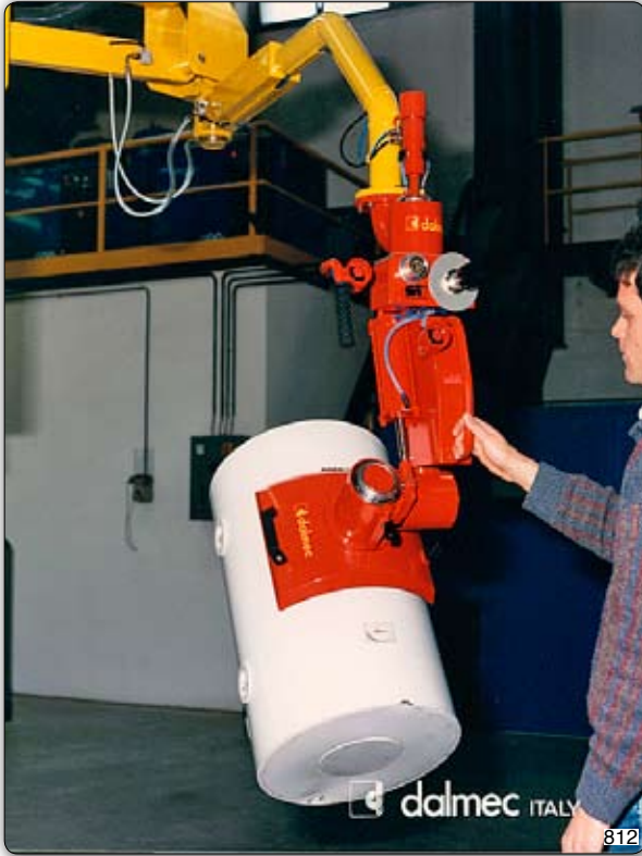
Partner PMC column mounted Manipulator, with suction cup tooling (Venturi) for gripping and manual rotation of boilers. Manipulator Partner PMC, 支柱式, 真空吸盘 (文丘里), 用于抓取和手动翻转锅炉。