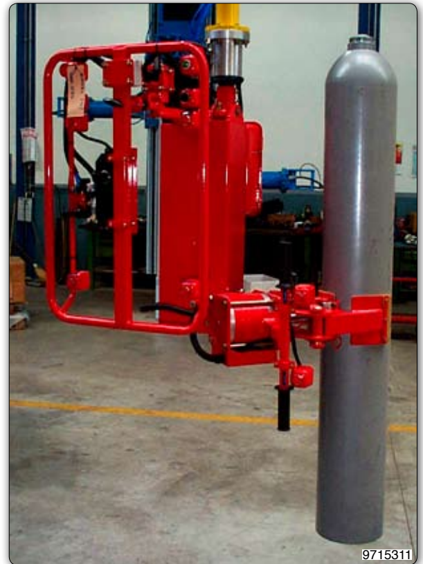
Manipulator with pneumatic tooling for gripping and inclination of cylinders having different dimensions. 装备气动工具的机械手臂, 用于抓取和倾斜不同尺寸的气缸。