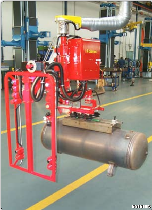
Manipulator with suction cups tooling (Venturi) for gripping and handling of tanks. 装备真空吸盘 (文丘里) 的机械手臂, 用于抓取和搬运油箱。