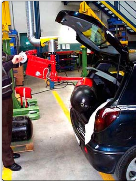
Manipulator with adjustable suction cups tooling (Venturi) for gripping and handling tanks. 装备可调节真空吸盘（文丘里）的机械手臂，用于抓取和搬运油箱。