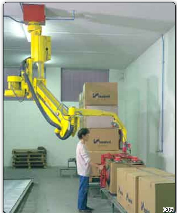
PMF type Partner manipulator, fixed overhead, equipped with suction system to grip and handle cardboard boxes from the packaging lines to pallets.