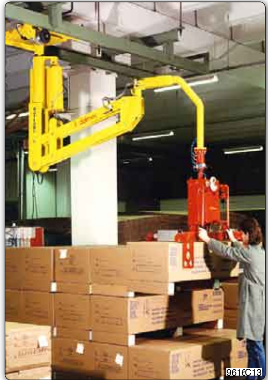
PMS type Partner manipulator, overhead trolley mounted, with motorised pneumatic drive, equipped with special gripper tooling, which allows the operator for gripping and 90° inclination of the box, so that pins can be fitted under the same. It is also completed with tracking system made by Dalmecc.