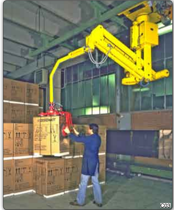
PMS type Partner manipulator, overhead trolley mounted, suitable for stacking boxes containing a variety of washing machines which arrive from the packaging line. A pneumatic motor drive is also fitted to the system, which runs in Dalmec overhead tracking.