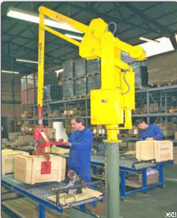
PSC type Partner manipulator, column mounted, fitted with pneumatic gripper tooling. The special design of the tooling jaws allows the handling of a particularly wide range of wooden cases.