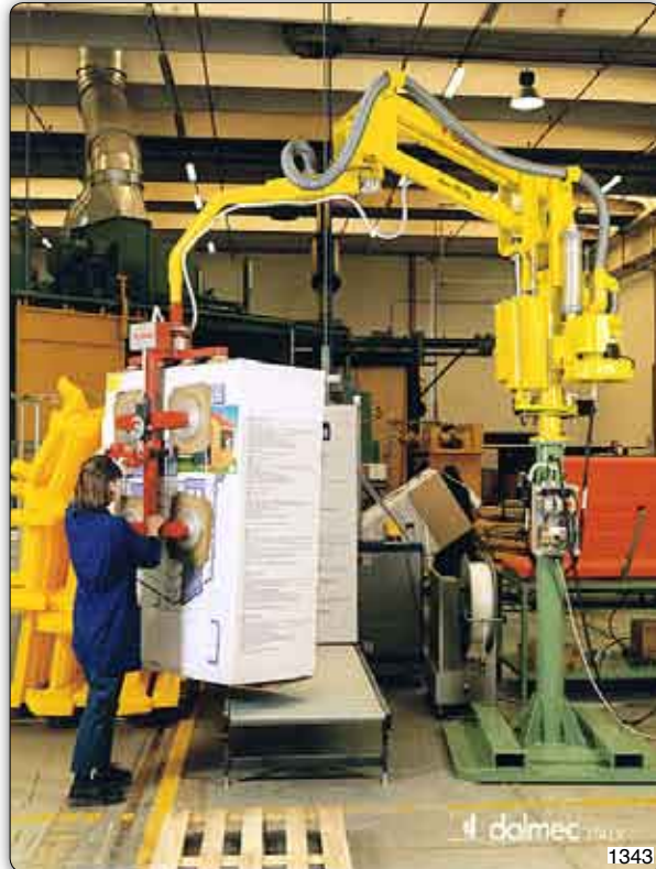
PMC type Partner manipulator, column mounted, fitted with suction tooling to grip and handle cardboard boxes from a packaging line to a pallet.