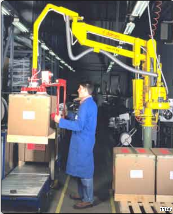
PMC type Partner manipulator, low profile model, fitted with suction head for gripping cardboard boxes and designed to operate in an area with a low ceiling.