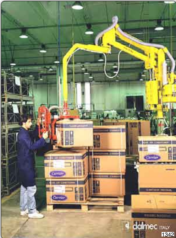
PMC type Partner manipulator, column mounted, with suction gripping system, a popular design, commonly used for moving packing boxes from a conveyor belt to a pallet.