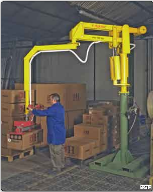
PMC type Partner manipulator, column mounted, equipped with jaws gripping system, for the palletization of packing boxes.