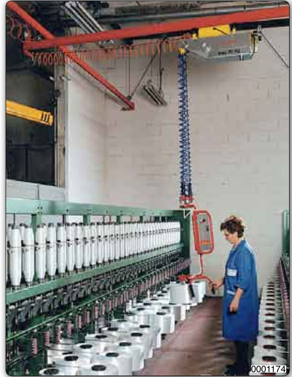
MPS Minipartner manipulator, overhead trolley mounted running in a bridge crane, fitted with pneumatic tooling head for the handling of reels.