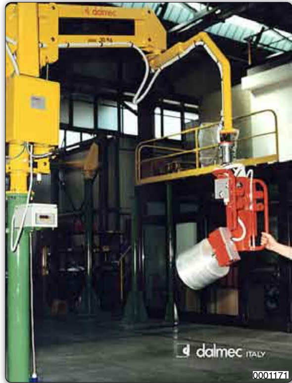
PMC type Partner manipulator, column mounted, equipped with an expanding mandrel for handling and 90° inclination of reels. The manipulator has a load cell for checking the weight of the reels.