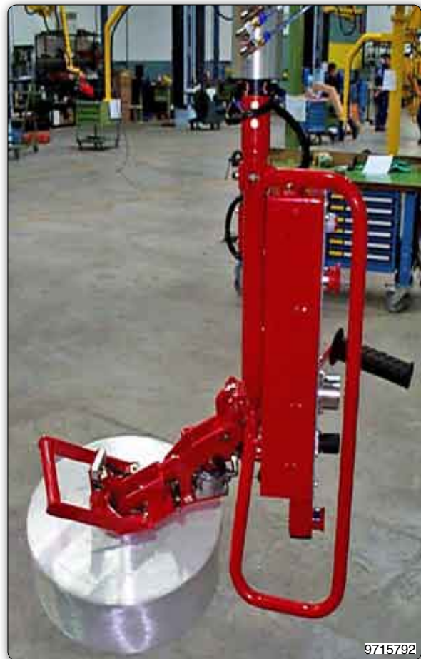
Manipulator equipped with an expanding mandrel for handling and manually rotating from horizontal axis to vertical axis or viceversa reels of thread.