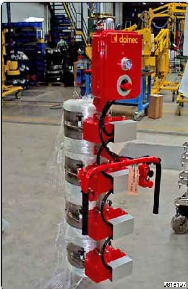
Manipulator equipped with 4 sets of pneumatic grippers for gripping fibreglass reels simultaneously.