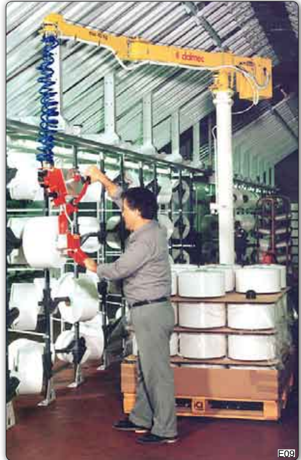
Manipulator with pneumatic expansion equipment for handling reels, fitted with manual rotation, to index the reel from the horizontal to the vertical.