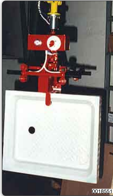
Manipulator with pneumatic tooling for handling shower plates.