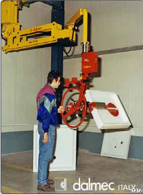
PMF Partner Manipulator, fixed overhead, equipped with suction cups tooling (Venturi) for gripping and manual rotation of shower plates.