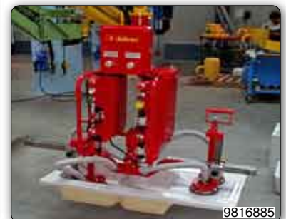
Manipulator with jaws tooling for gripping sanitary, their releasing into the cartons, gripping the packaged boxes and their pallettization.