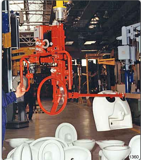
Manipulator with interchangeable suction cups tooling for gripping and handling of sanitary with manual rotation.