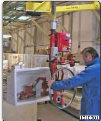
Manipulator with suction cups tooling (Venturi) for gripping and rotation of sinks.