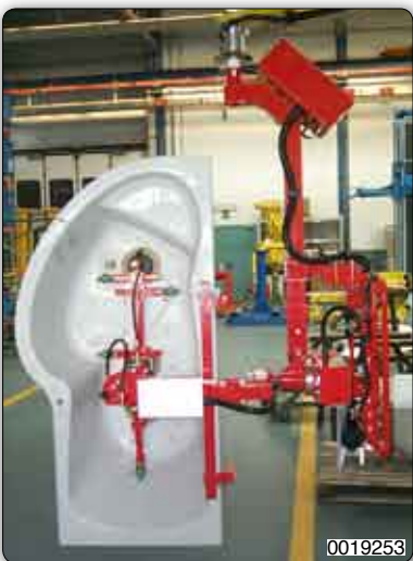
Suction cups (Venturi) Manipulator for gripping and rotation of bathtubs.