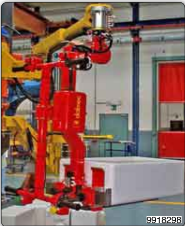
Manipulator with forks type tooling for handling sinks.