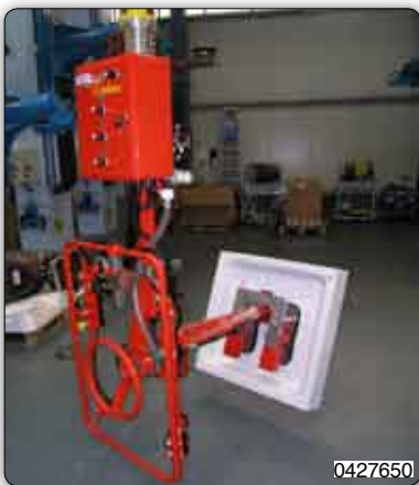
Manipulator with suction cups tooling (Venturi) for gripping shower plates.