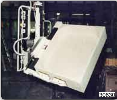
Manipulator with pneumatic tooling for gripping and rotation of shower plates.