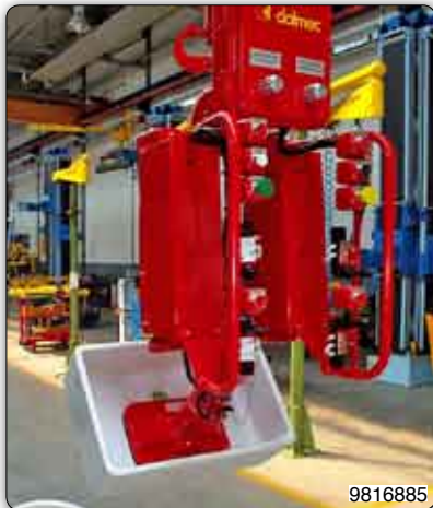
Manipulator with suction cups tooling (Venturi) for gripping and inclination of sinks.