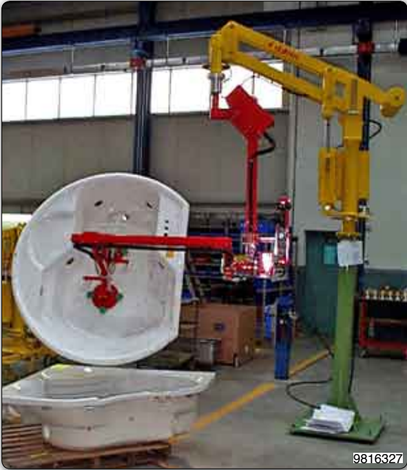
Suction cups (Venturi) Manipulator for gripping and rotation of bathtubs.